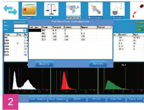
● Calibration info