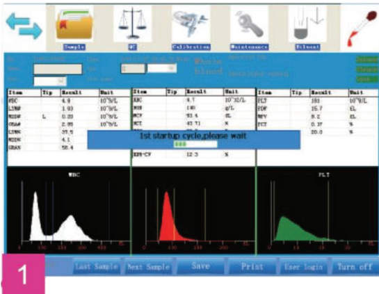
● Full screen info with color histogram